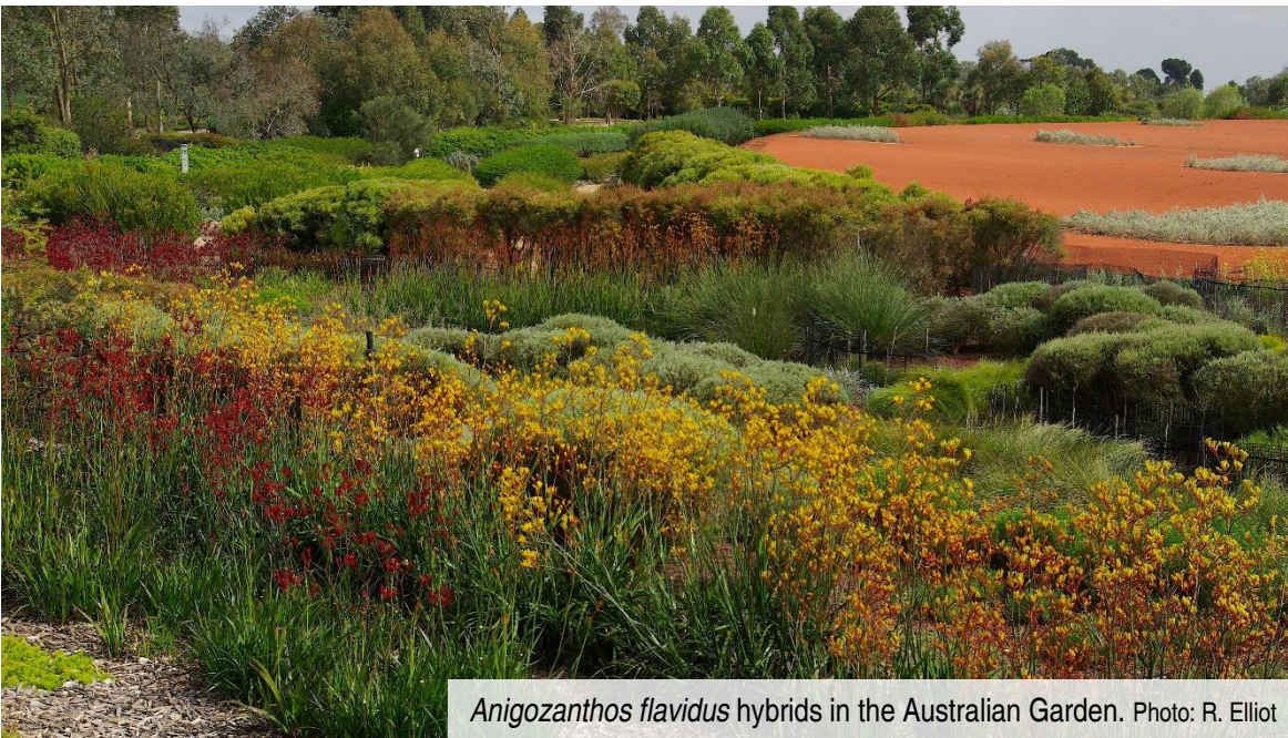
Anigozanthos flavidus hybrids in the Australian Garden.