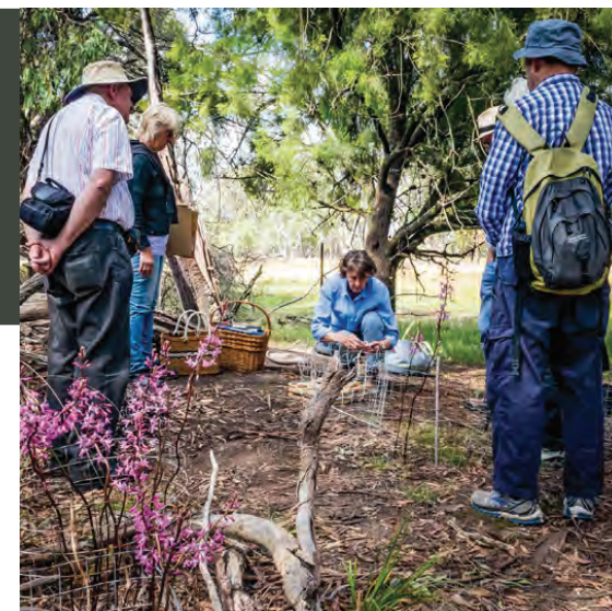
Herbarium Collectors, Photo: Mack Fenwick

After drying, the plant specimens are mounted to a strict format, for preservation and use in the