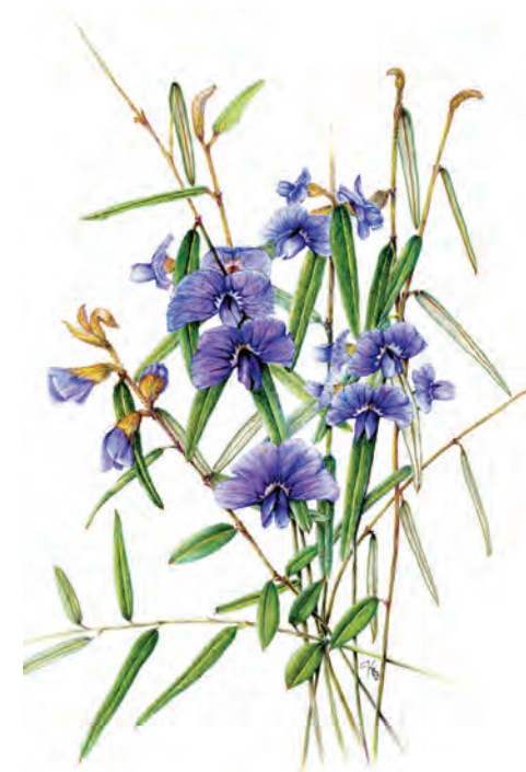
Kerryn Robinson, Hovea heterophylla

We also arrange botanical art workshops, demonstrations and talks conducted by established artists. With the maximum class size of 10 ensuring