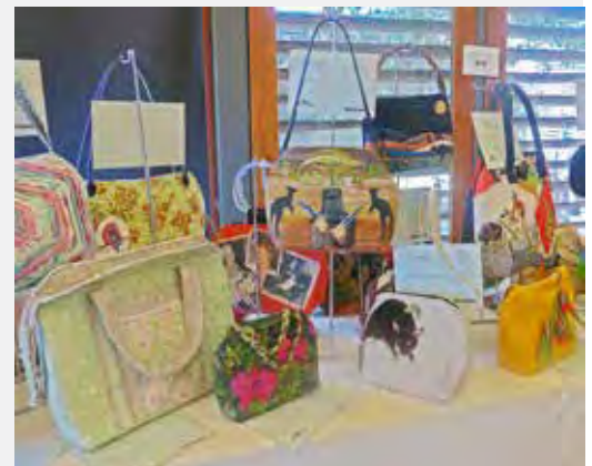
Handbag display at the Australian Textile Exhibition.

There is now a permanent but constantly changing noticeboard displaying some of our work in the Elliot Centre