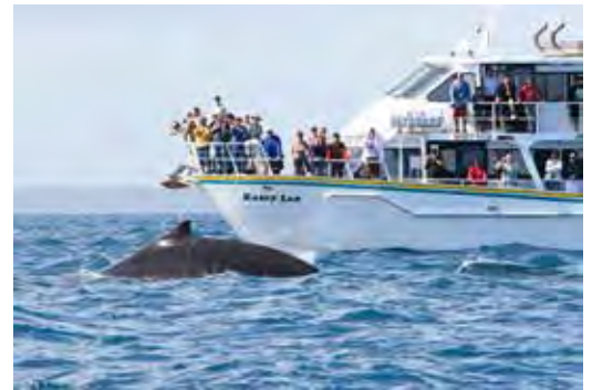
The Kasey Lee on which we will be aboard to watch whales, seals, dolphins and various seabirds as we travel around Phillip Island.