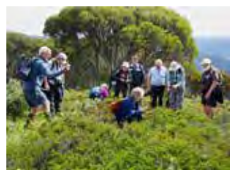
On top of Mt Little Higginbotham.