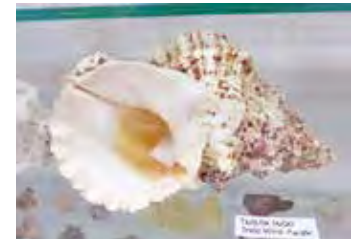
Tutufo bubo shell at the Inverloch Shell Museum.

Discovery Day: Inverloch Dinosaur Fossil Tour See page 8