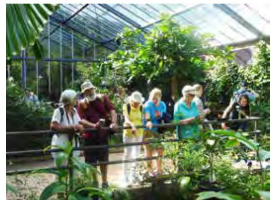
Cranbourne Friends at the Butterfly House, Melbourne Zoo.

We were very fortunate to see the Zoo's breeding program for the Lord Howe Island stick insect, which was assumed extinct. The zoo staff involved in this program spoke to us about their work, and we viewed the life cycle from the eggs to the adults.