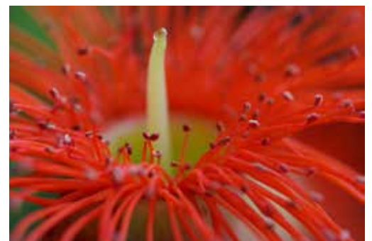
The brilliance and intricacy of a Corymbia ficifolia 'Baby Orange' flower.