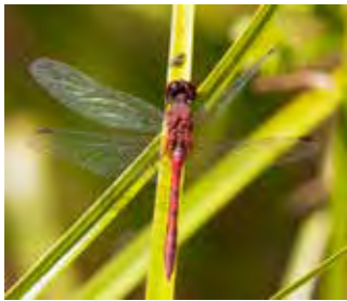
A photogenic Wandering Percher beside water at Dinner Plain.

Boronia algida (alpine boronia) was also a bit of a puzzle for Joe, but the few remaining four-petalled flowers and the aroma gave it away.