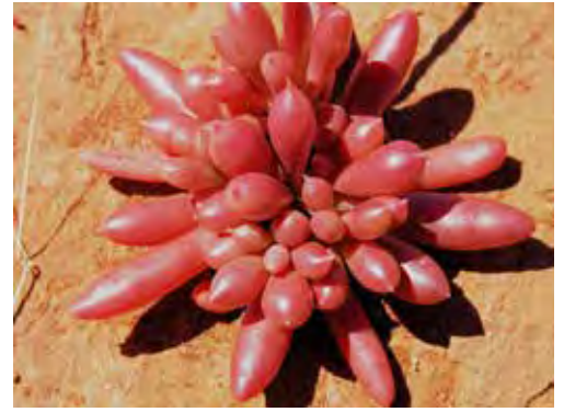
Stunning jelly-bean like leaves of the prostrate annual, Calandrinia creethae.