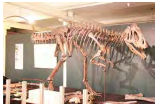
Dinosaur Skeleton.