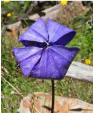
Spider house is full in this Wahlenbergia gloriosa on the Dargo High Plains Road.