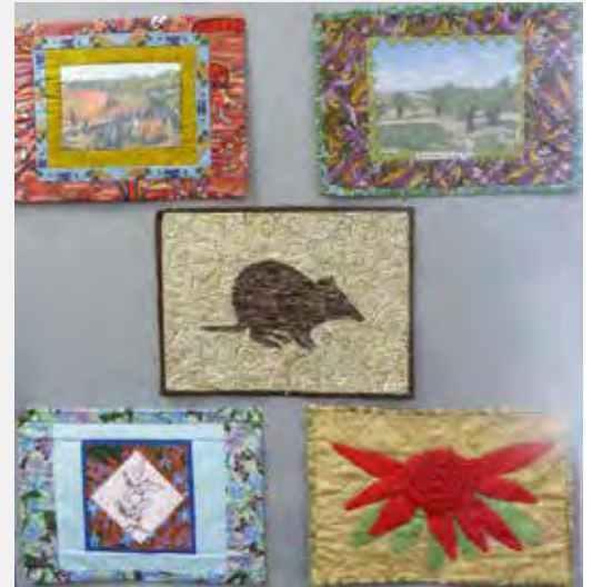
The Botanical Fabricators display in the Friends Elliot Centre.

The dates for next year's Australian Textile Exhibition will be different. It will be held from Tuesday 8 May through to Sunday 13 May 2018 (Mother's Day).