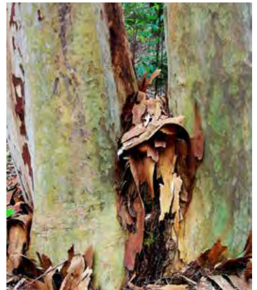
Recently shed bark at the base of Angophora costata trunks.

Frank will also talk about VICFLORA , an online publication that is now available to the public ( https://vicflora.rbg.vic.gov.au/ ). It is a marvellous and valuable resource that provides much information in text and includes many photographs. Once you hear about VICFLORA , you will undoubtedly want to experience it for yourself.