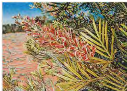
Grevillea with bees. Work by Geoff Sargeant

To coincide with the Botanical Illustrators exhibition, 'Native Seduction', we are privileged to hold a two-day colour pencil workshop with Geoff Sargeant. The workshop will explore the subtleties of drawing foliage and is open to all skill levels. A materials list will be supplied upon registration.