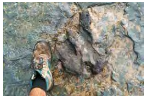
Dinosaur footprint.

Lyn Blackburne 9776 4994 or 0419 583 076 lynb1950@gmail.com