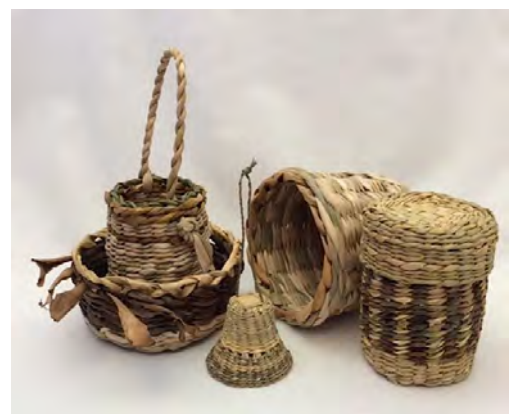
Results from creating baskets over a mould

For more information, contact Lynn Lochrie on 0437 759 610, or at lynnlochrie@yahoo.com.au