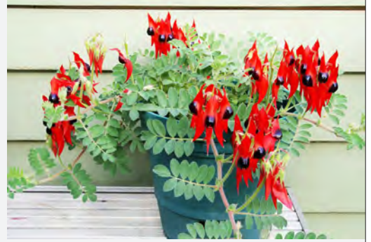
Sturt Pea, Swainsona formosa thriving in a waterwell pot.

Swainsona formosa is the floral emblem of South Australia and is found growing in the low rainfall desert areas of that state, although it is known to cross the border into WA and NSW. It is best grown in a container from seed; Charles suggested that the seed germinates successfully if covered in hot water (not boiling) and soaked overnight. Use good well-drained potting mix as they like to be moist but not wet and don't water onto the leaves. They also respond well to