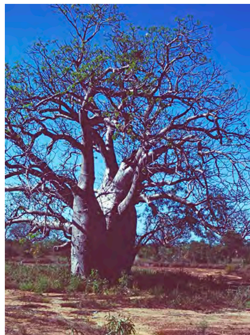
Boab, Adansonia gregorii near Fitzroy River

Brachychitons can be pruned quite severely and very large trees can be transplanted, as we have seen at Cranbourne Gardens. You can