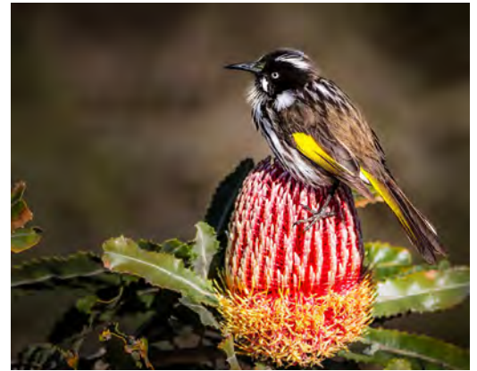
New Holland Honeyeater is one of the common honeyeaters in the Australian Garden which frequently visits Banksia menziesii flowerheads.

We hope to cover subjects such as the hierarchy of birds, how birds utilise vegetation, corridors for birds, whether we