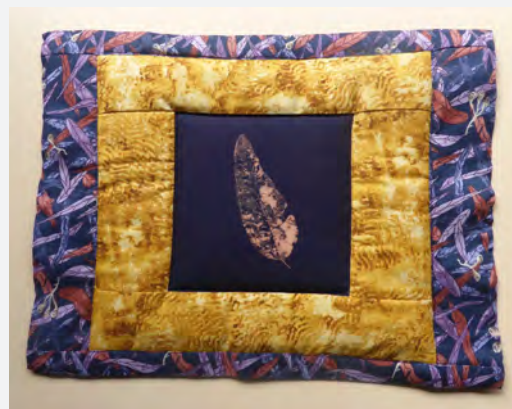
Mini-quilt with central square design from a bleached eucalyptus leaf.

Don't forget that the dates for next year's Australian Textile Exhibition will be changing, and it will be held from Tuesday May 8th 2018 through to Sunday May 13th (Mothers Day).