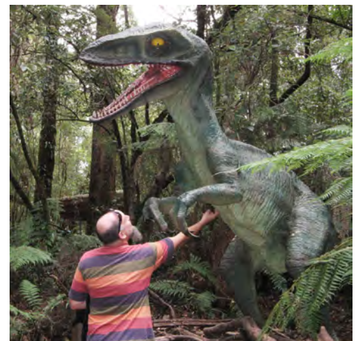
A life-size model Theropod meets a human!

• Check out the Melbourne Museum 600 million years exhibit https://museumvictoria.com.au/melbournemuseum/discoverycentre/600-million-years/ .