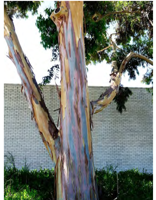
The old darker bark is shedding to reveal the smooth cream bark on Sydney Blue Gum, Eucalyptus saligna