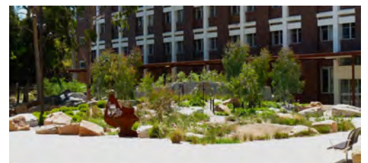
The young Earth Sciences Garden is a treasure trove of rocks and plants