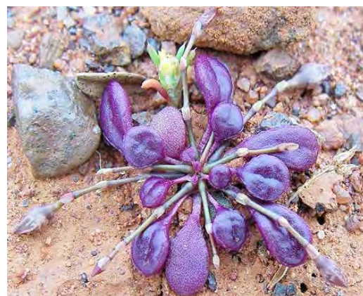
This Calandrinia species shows an unusual purple colouration to the leaves