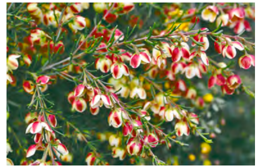
Boronia megastigma 'Harlequin': About 30% of people are not aware of the beautiful floral perfume of Boronia megastigma .

AB Bishop, an experienced horticulturist, devotee of Australian plants and author of a number of books, including co-author with Angus Stewart of The Australian Native Garden , will talk about sensory aspects of the Australian flora and enlighten us on those extra special plants that we can use in our own gardens.